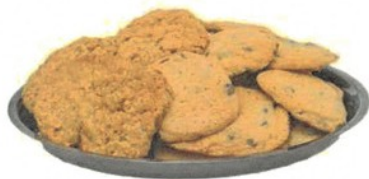
Cookie Tray $.35 per Cookie