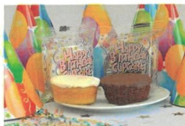
Cupcake Tray $.75 per Cupcake